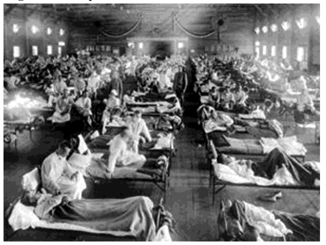
Hospital of Camp Furston, Kansas (now called Fort Riley), 1918.

It was the so-called second wave, in the autumn of 1918, which was responsible for most of the deaths, due to an unusually severe, hemorrhagic pneumonia. Therefore it is still uncertain whether the first wave appeared in Europe or in America, and it must also be determined if links can be established