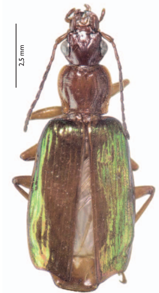
Figure 1. Calleida desenderi sp. n., female paratype, habitus, dorsal aspect.

Etymology and dedication. It is a great honor for me to dedicate this new Ecuadorian species to the memory of Konjev Desender, the Belgian carabidologist who contributed greatly to the knowledge of carabids of the Galapagos Islands, the famous archipelago belonging to the Republic of Ecuador