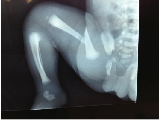
FIGURE 1: Rx showing right femur fracture.