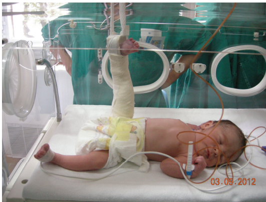
FIGURE 2: Immobilization of the right leg in extension.

the newborn. The examination revealed a fracture of the right femur in which the proximal segment displaced anteriorly compared to the middle and distal segment (Figure 1). The bone structure and mineralization were visibly normal; there was no indication of any other fracture/bone deformities or anomalies osteo-articular (blue sclera, osteogenesis imperfecta, or hypotonia). In particular, Welding-Hofmann disease, the pathology that promotes bone atrophy and facilitates pathologic fractures of long bones, was excluded.