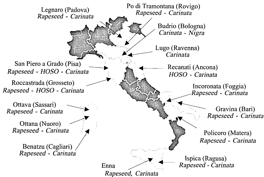
Figure 1. On farm trial locations of the "Bioenergie" project in the year 2007-2008.

farms, on a surface of at least 1 ha for each crop, applying common farm mechanisation methods, even if the trials and the results were evaluated also by a three-replicate randomised samplings. The trials were located in seven Italian regions: Veneto – Po di Tramontana (Rovigo); Emilia Romagna – Lugo (Ravenna); Marche – Recanati (Ancona); Tuscany – Roccastrada (Grosseto); Apulia – Gravina in Puglia (Bari); Sicily – Ispica (Ragusa) and Sardinia – Ottana (Nuoro).