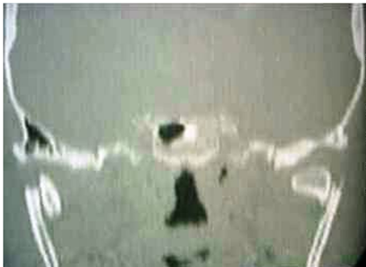
Figure 2 CT scan that indicat surgical treatment.

Also the age of the patient governs the type of therapeutic treatment. During the years of growth some authors have found a greater capacity for morphofunctional recovery of the fractured condyle in comparison with adult patients. Thus the therapeutic approach can vary not only according to the type of fracture, but also the type of patient. The two main therapeutic directions envisage on the one hand orthopaedic-functional treatment and on the other surgical treatment. Orthopaedic-functional therapy remains the most commonly used by various authors, permitting as it does an optimal functional recovery. Here it must be underlined that an intermaxillary blockage determines two main problems; as well