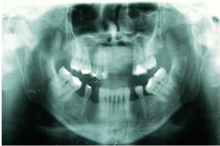
Figure 1 Pre operative Orthopantomograph.