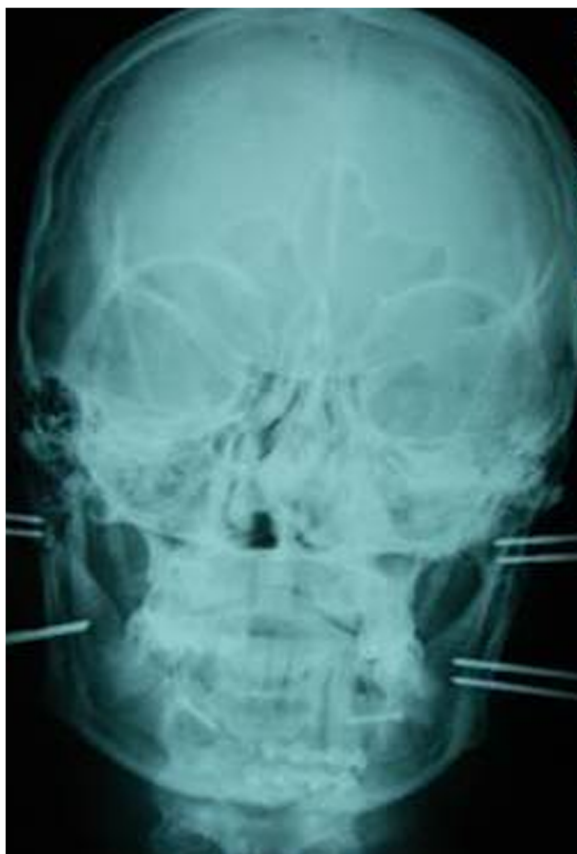
Figure 5 Post surgical CT scan.

these cases, conservative therapy, whilst assuring good dental occlusion in general terms, often does not allow complete recovery of the mandibular movements [15]. Moreover, in the opinion of other authors too, it is difficult to achieve completely satisfactory results from both an aesthetic viewpoint (due to the reduction in height of the ramus) and a gnathological standpoint because of the frequent presence of pre-contact during mandibular movements. Very recently, the direction of the treatment to resolve the greatest possible number of problems linked to fractures of the mandibular condyle, is fast tending towards a surgical approach, thanks not only to new physio-biomechanical acquisitions of the complex temporal-mandibular joint, but also to the development of new surgical techniques such as REFs which allow an optimal adaptation of the fractured fragments without the need for inter-maxillary blockage and the resultant immobilisation of the temporal-mandibular joint. Broadly speaking, the choice of surgical technique is conditioned by various factors such as : the focus of the fracture, the position of the condyle, the time elapsed from the traumatism, the extent of local oedema the type of surgical.