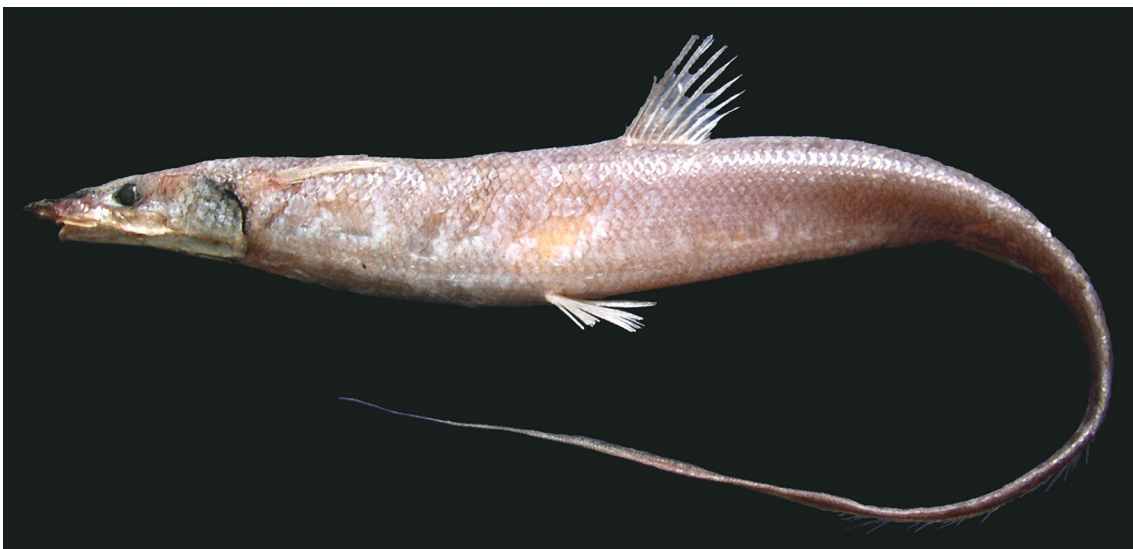
Fig. 2. Halosaurus ovenii , DSZ-04/07, 470 mm TL, Sardinia, Western Mediterranean, 200 m depth

tification of the oocyte developmental stages was carried out using an optical microscope, according to the scale proposed by Forberg (1982). Gonadic maturity stages were determined on the basis of the relative abundance of oocytes cells in the more advanced stage of development. The diameter of nucleated oocytes was measured by means of a graduated ocular.