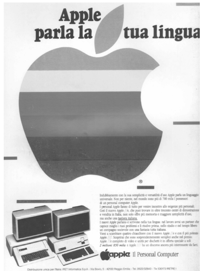
FIGURE 2: Italian advertising for the launching of Apple II: Apple speaks Italian