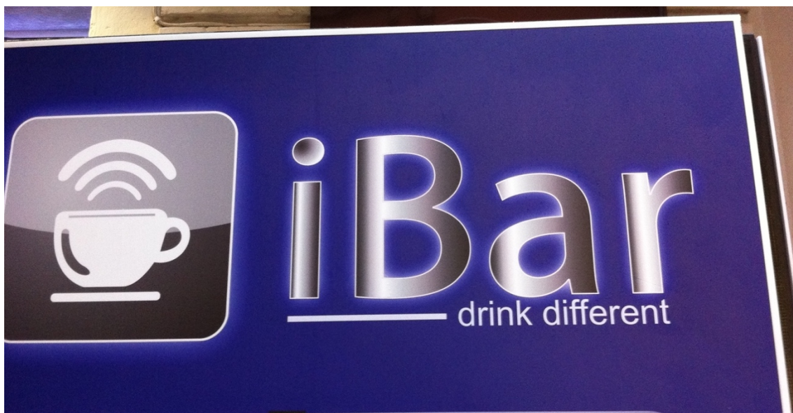
FIGURE 3: “Drink Different”, Italian imitation of the Apple advertising campaign “Think Different” (coffee bar in Cagliari, Italy, 2017)