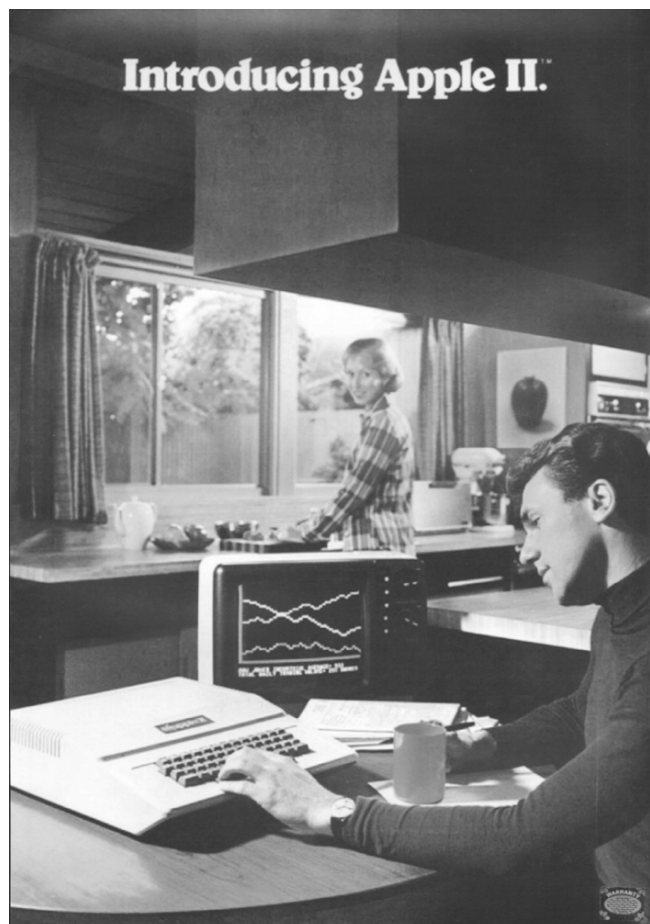
FIGURE 1: Working at home (launching of Apple II, about 1977)

Looking even today at the second-hand prices of the models of thirty years ago one can understand the diffusion of a distinctive taste for these devices. Like other brands of global diffusion, the Bite Apple logo, first the one with colored stripes then the one with the unmistakable white, promises a special experience that starts with the care of the packaging and the way of extraction. Like other global brands, if not more, the Bitten Apple logo and its founders have become true 'pop icons' 19 . Other technological objects of our daily life - radios, TVs, record players, discs, gramophones, portable record players, etc. - have now become “memories of media”, to use the expression by Roger Silverstone (1999: 93). In some interviews carried out a few years ago, some students stated that they did not want to get rid of, for example, an initial model of the iPhone, that of series 3, considered, with its rounded shapes, much more ergonomic and “beautiful” than the next more advanced models. The time limit therefore of the devotion to Apple computers, has been further shortened, so much so that some websites have reported the growth in price among collectors passionate about 2013-2014 computers 20 .